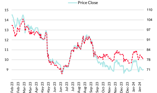
Sino Thai Engineering & Construction Plc (STEC TB)